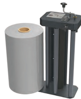
MECHANICAL BRAKE SYSTEM