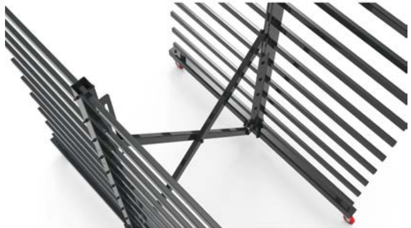
DOUBLE DRYING RACK (OPEN)